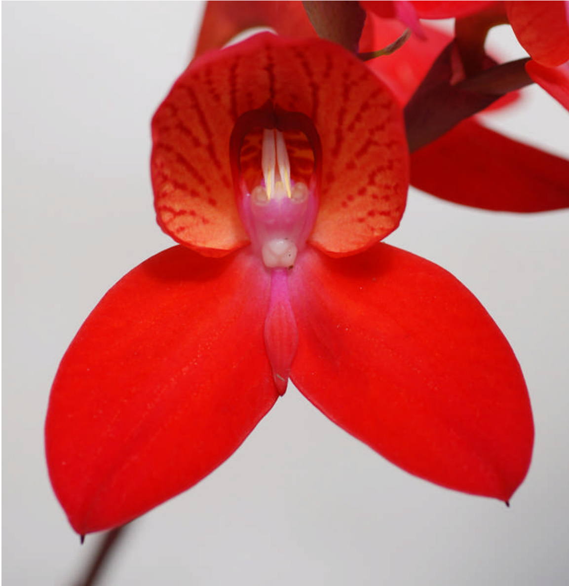
Disa Hybrid Grown by Wally Orchard