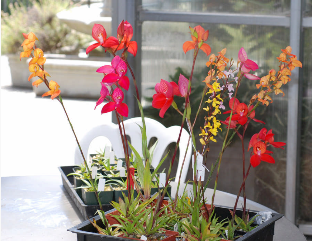
Disa Grouping Grown by Wally Orchard