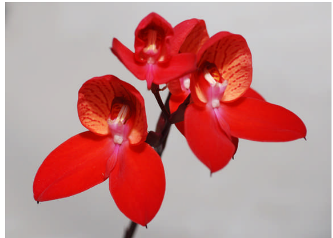
Disa Hybrid Grown by Wally Orchard